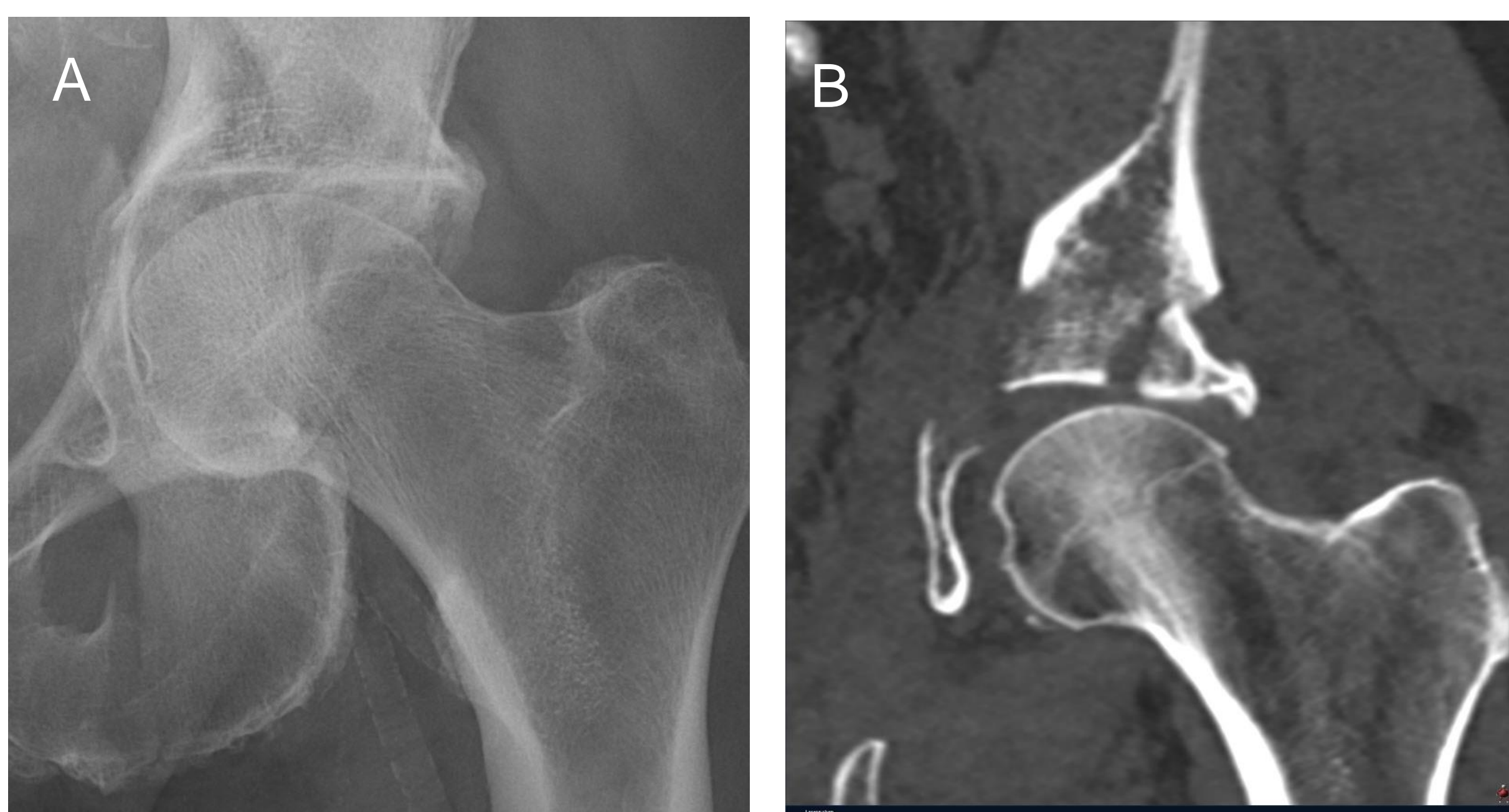
Figure 1 "Gull-sign" in the X-ray and the correlating impacted superomedial dome fragment in the CT.